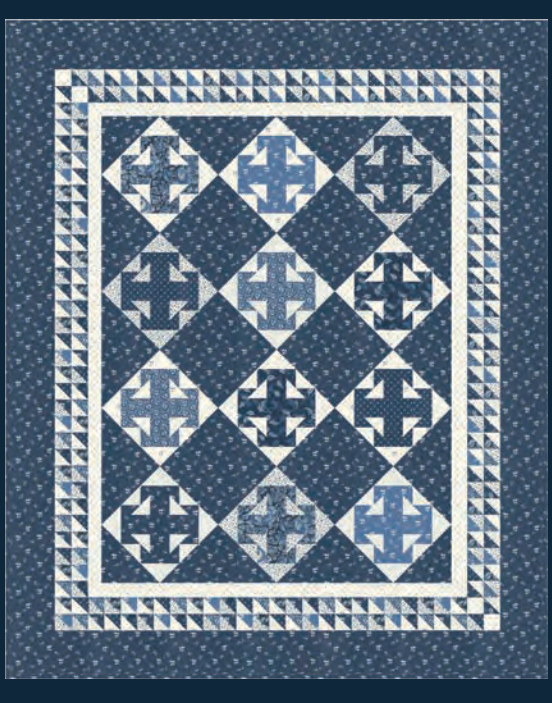
BCD 1602 Temperance 48" x 59"