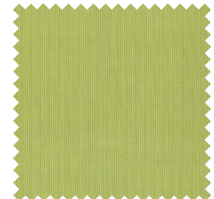
Nº 5528 13 Pickle