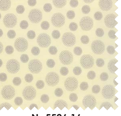
Nº 5526 16 Mist