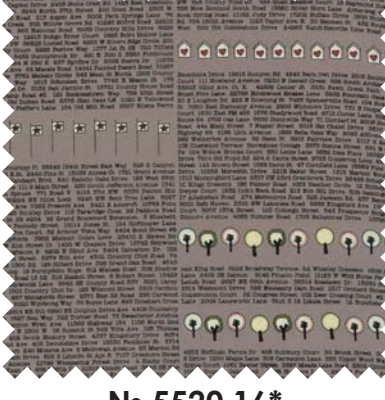
Nº 5520 16* Mist