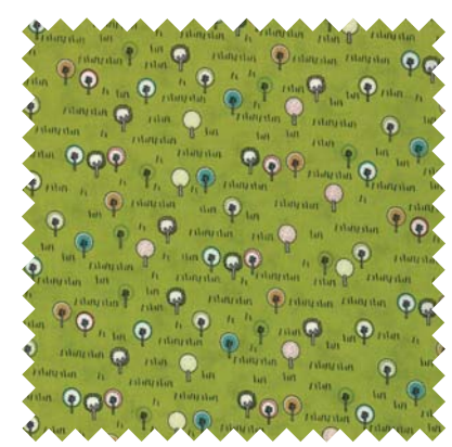
Nº 5523 13* Pickle