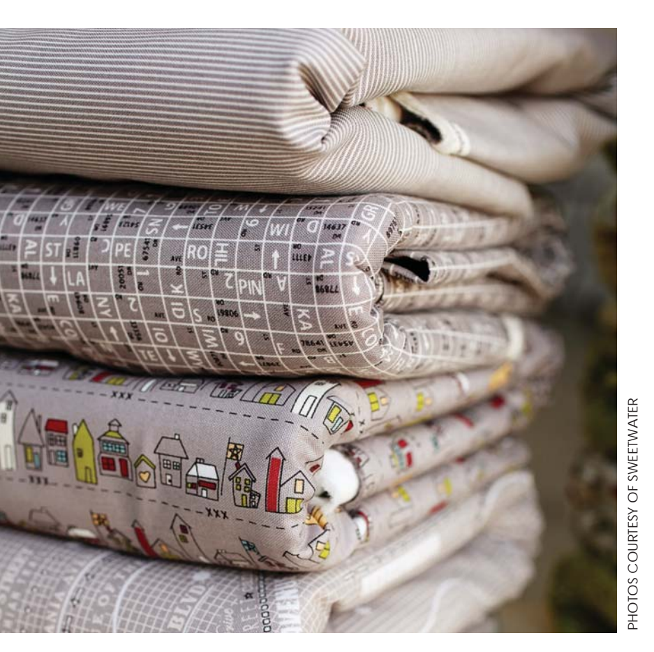
ide a second parties in