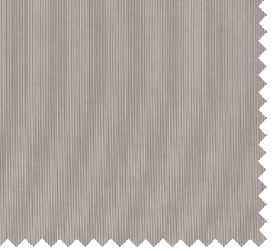
Nº 5528 16 Mist