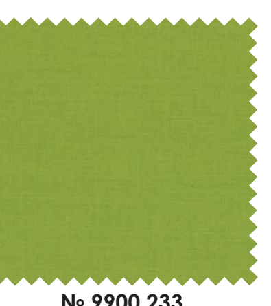
Nº 9900 233 Pesto