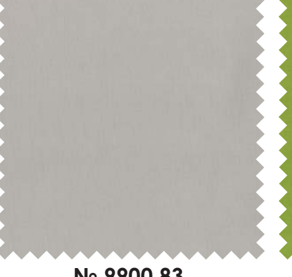
Nº 9900 83 Grey