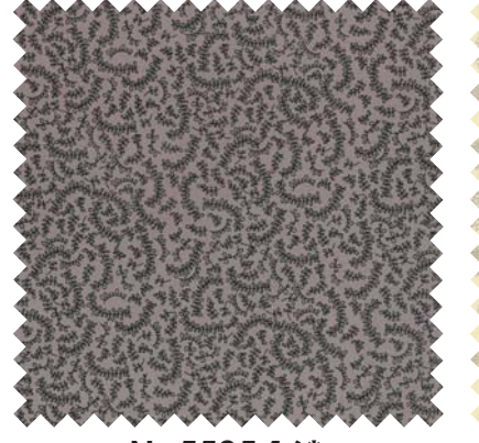
Nº 5525 16* Mist