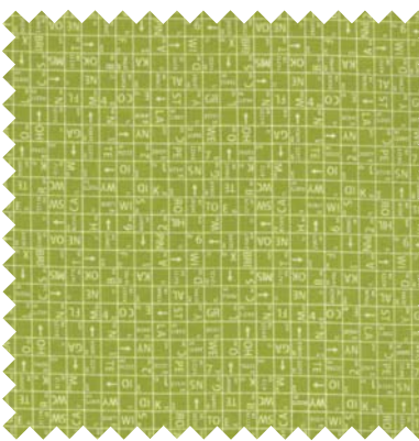
Nº 5524 13* Pickle