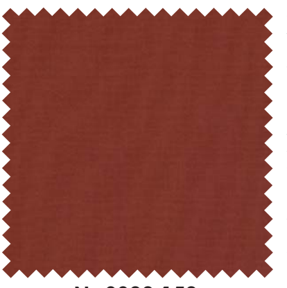
Nº 9900 150 Kansas Red